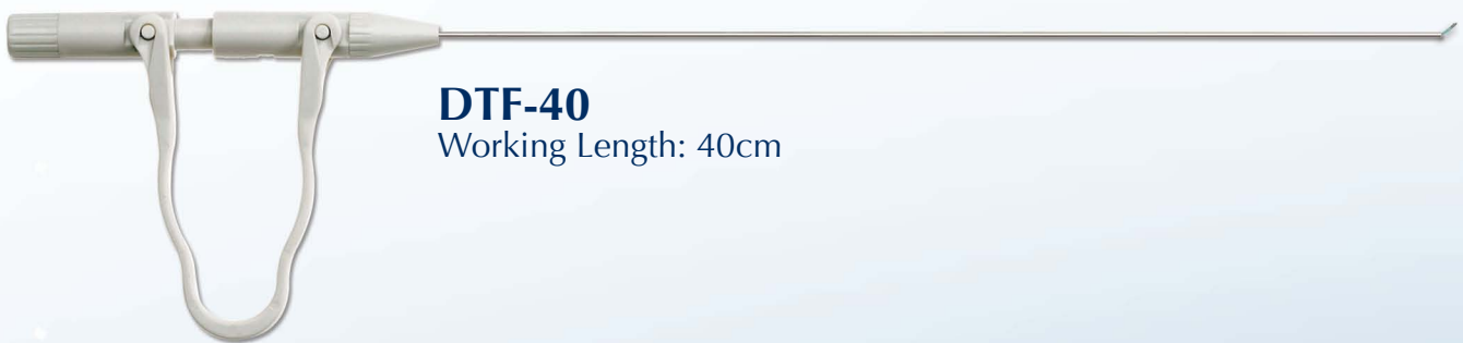
DTF-40 Working Length: 40cm

elliquance™ technology incorporates the patented Surgi-Max® Radiowave energy source which utilizes high frequency, low temperature radiowaves to perform traditional scalpel, scissor, electro-surgical and laser assisted procedures. The cell-specific tissue effect affords unparalleled surgical precision while sparing healthy tissue. The low temperature emission results in non-adherent bipolar performance which minimizes tissue trauma and eliminates frequent cleaning and instrument irrigation.